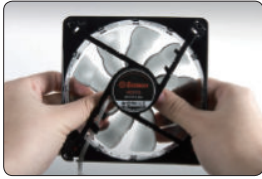
Detaching the blades (UCTB8/9/12/14)

Carefully press the fan blades from the backside until it clicks.