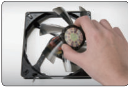
Attaching the blades (UCTB14)

Press the centre of the blades towards the frame until it clicks.